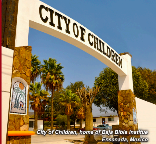
City of Children, home of Baja Bible Institute Ensenada, Mexico

1095 Carl T Jones Drive | Huntsville, AL 35802